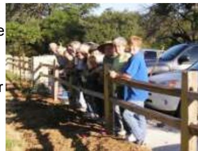
Taking a break and admiring our work!

implement a beautification project for the betterment of Glen Rose and Somervell County and to bring back roses to Glen Rose. It is called Project 2010 Rose Bush and the concept is to plant 2,010 Earth-Kind® Roses in the year 2010. These rose bushes will be planted throughout Glen Rose and Somervell County. The Chamber of Commerce office will be the coordinator of the project, while the MG's will offer advice on selection and care of the roses. This project will serve as a fundraiser and proceeds will be split between the Chamber and the SCMGA.