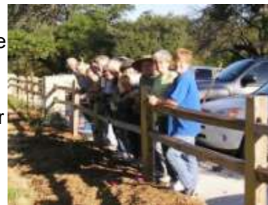
Taking a break and admiring our work!

implement a beautification project for the betterment of Glen Rose and Somervell County and to bring back roses to Glen Rose. It is called Project 2010 Rose Bush and the concept is to plant 2,010 Earth-Kind® Roses in the year 2010. These rose bushes will be planted throughout Glen Rose and Somervell County. The Chamber of Commerce office will be the coordinator of the project, while the MG's will offer advice on selection and care of the roses. This project will serve as a fundraiser and proceeds will be split between the Chamber and the SCMGA.